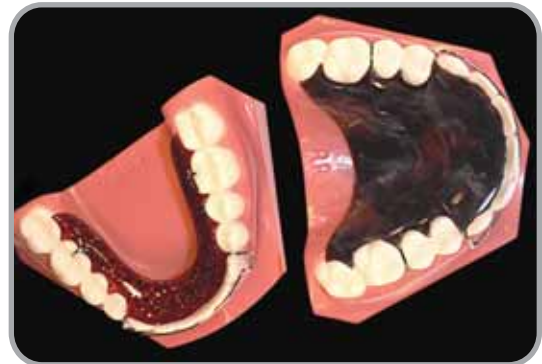
Our standard Hawley consist of Cuspid to Cuspid labial bow and Ball Clasps. The anterior acrylic is trimmed for rounded contact and includes a full acrylic palate.

AOA's Retainer department can process virtually any clasping request as well as Finger Springs and acrylic modifications, such as Bite Planes and occlusal coverage. A wide variety of expansion and single tooth movement screws are available – just call for information. Pontics, anterior and posterior, may be requested with nearly any of our designs, or your custom design. Just indicate shade preference and we can match the shade with precision. Tissue compatible opaque acrylic may be requested to enhance the fit and blending of the pontic against the patient's contour.