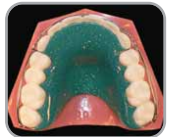
The very esthetic QCM form fitting Labial Bow. An ideal solution when Pontics are requested or veneer protection is required.