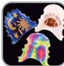
AOA offers dozens of custom acrylic designs. Request our Ideals Book .