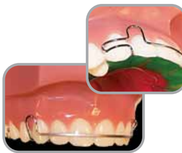
Popular Labial Bow options include the "Dual Loop" for Cuspid guidance. And the Flat Bow for providing positive control of tipping and torque. The Flat Bow is also available in Wraparound designs.